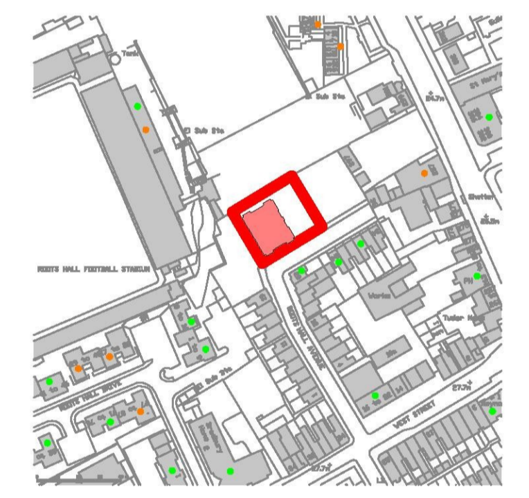
PROPOSED SITE LOCATION PLAN SCALE 1:250