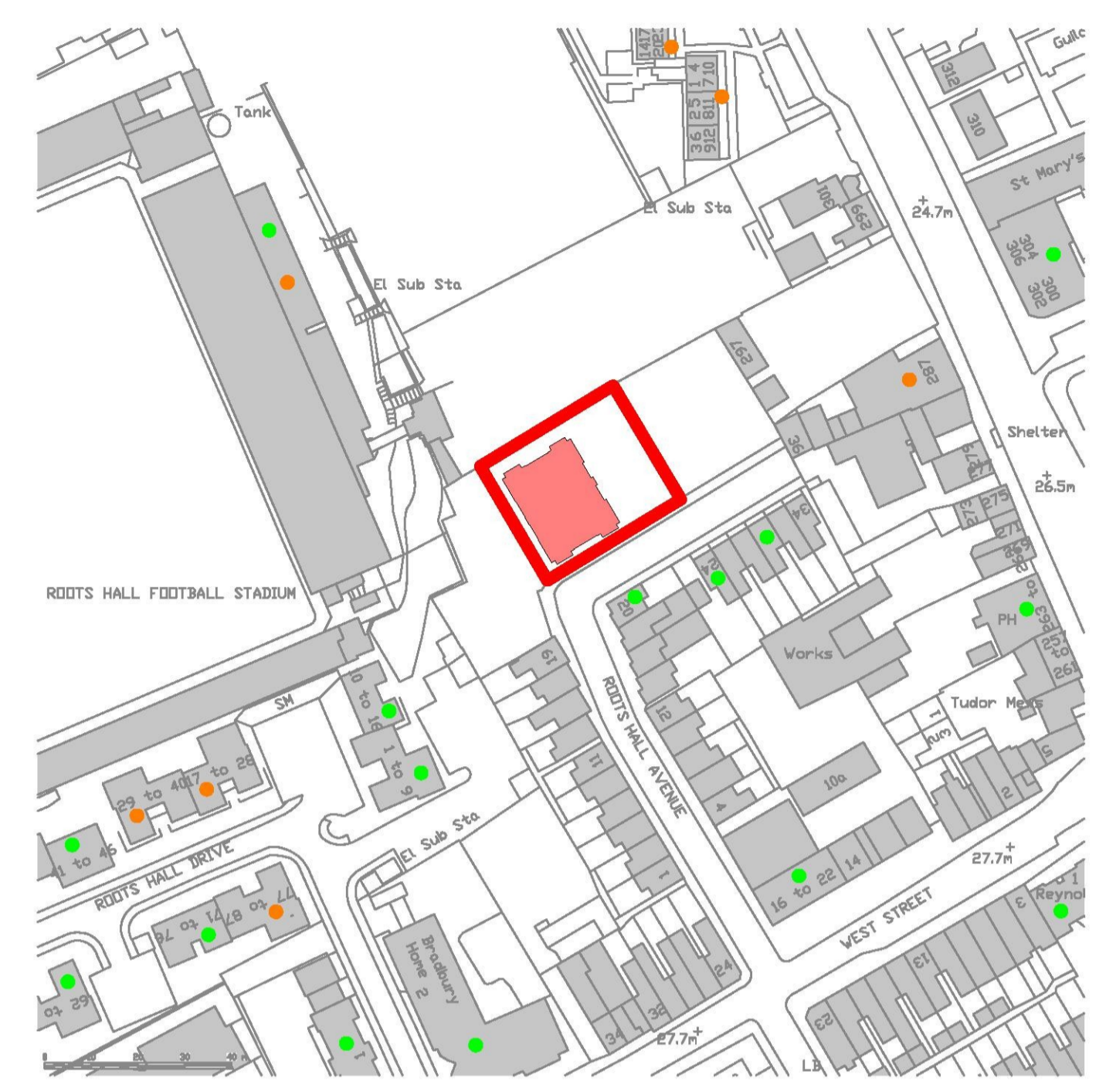
PROPOSED SITE LOCATION PLAN SCALE 1:250